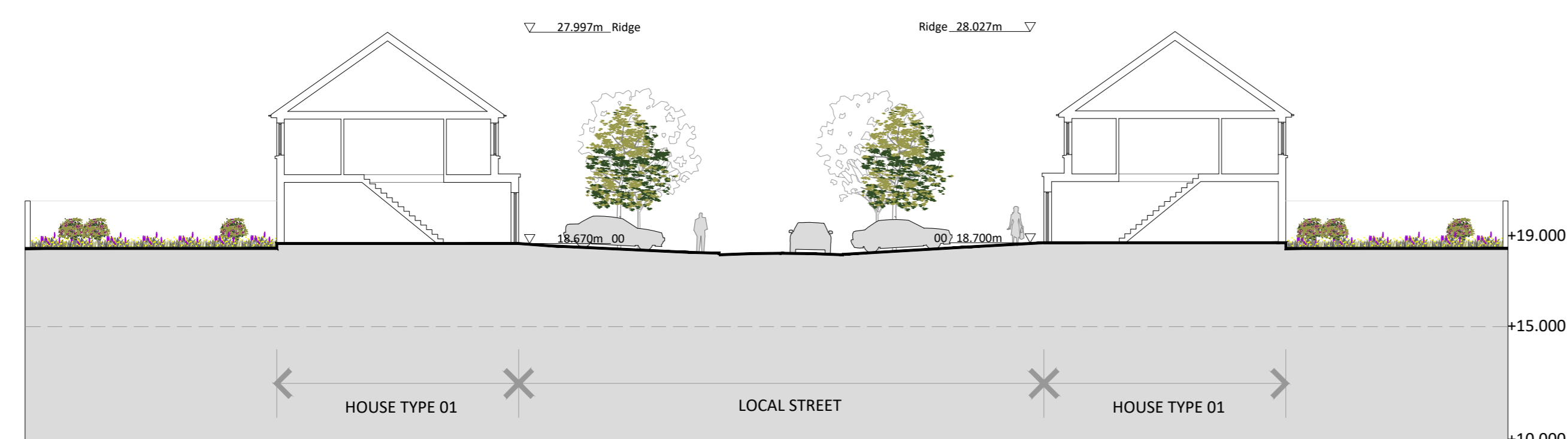
SECTION 3 1:200