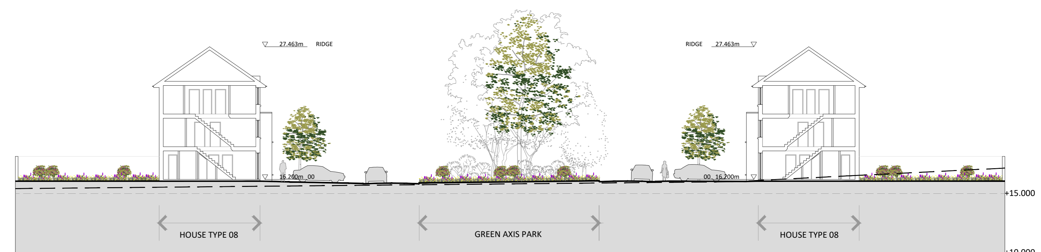
SECTION 4 1:200