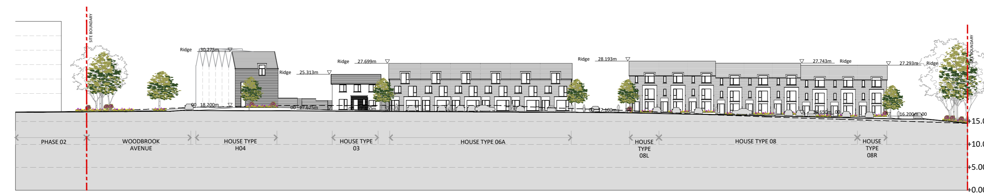
SECTION K-K 1:500