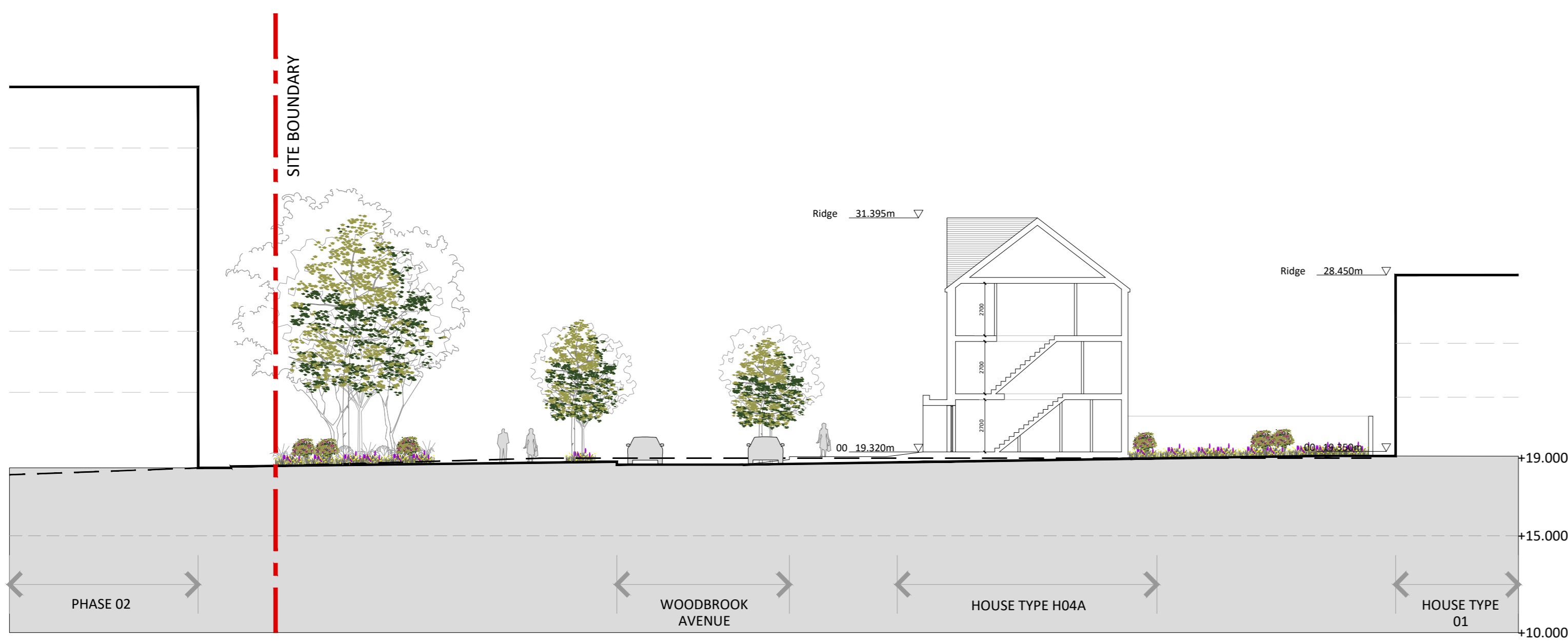
SECTION 1 1:200